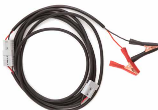
1 X 4.4M EXTENSION LEAD