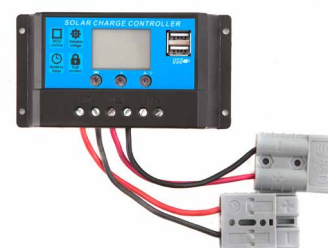
1 X PWM CONTROLLER