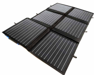
1 X 120W SOLAR BLANKET